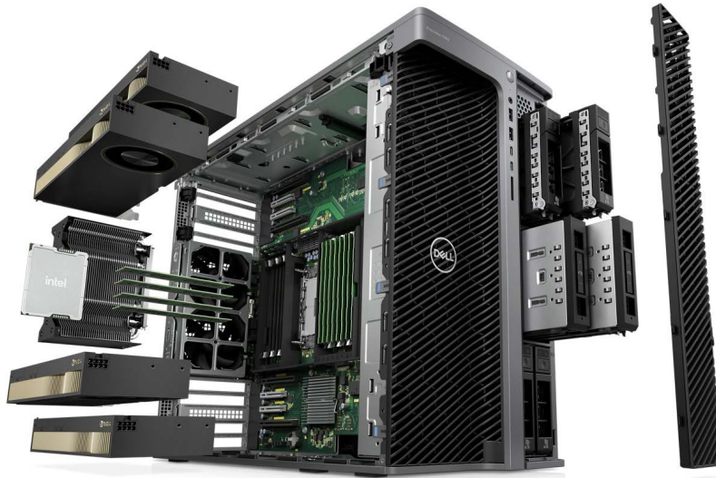
The Dell Precision 7960 tower workstation.

A dvanced, AI-based design and simulation tools operate more effectively and efficiently on engineering workstations equipped with the latest NVIDIA RTX™ GPUs.